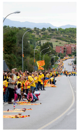
The Catalan Way

Almost 2/3 of the Catalan Parliament have agreed on holding a referendum