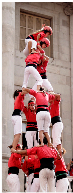
The castells are human towers

You've come to a Mediterranean country, the capital of which is Barcelona: it has 7.5 million inhabitants, an ancient culture and its own language, food, parliament, government and laws. We're a dynamic economic, industrial and tourist centre in the south of the European Union, and open to everyone. We hope you have a great stay with us!