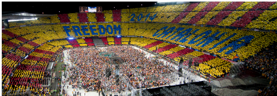
The concert for freedom

Democracy and the right to self-determination for peoples are basic, general principles of international law. But unlike the UK stance on Scotland, the Spanish Government rejects this out of hand, hiding behind the Spanish constitution, even though the Catalan government has pointed out 5 ways of holding a legal referendum in Catalonia and calls on dialogue to be able to do so. Democracy versus Constitution? It's simply a political obstacle.